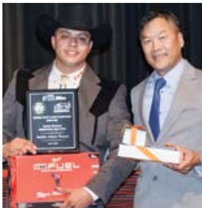
Residential Apprentice of the Year